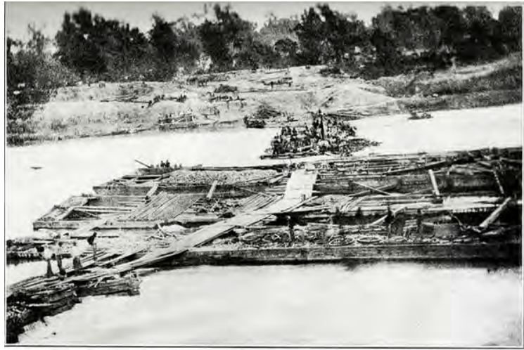
SECTION OF RED RIVER DAM.