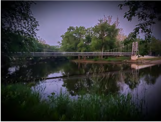
Amateur photographer Kim Schramm has a wonderful touch with a lens.